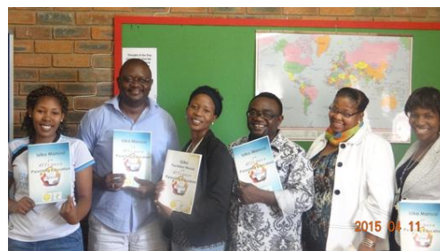
PLA facilitator training in South Africa holding their manuals featuring FCL and Kindred logos.